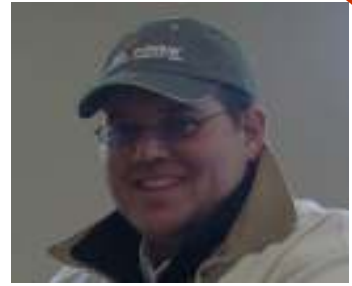
Building Relationships... One Handshake at a

What makes a great community? Is it the geography? Is it the types of houses? Is it the types of businesses? Is it the economy and livelihood? Is it the golf course? Although anyone with an addiction to golf like mine may say that is an arguable point... no. What makes a great community is the people that call it home! How fortunate are we to live in a city where the people care the way they do here! People care about one another... they care about the schools... they care about the city government... they care... and they want to make it a better place!